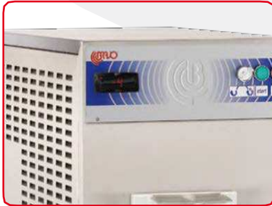
Thermo-regulator by display