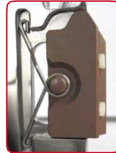
Interchangeable metal scrapers