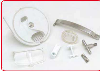
Complementary door is disassembled without the use of tools, for a perfect hygiene