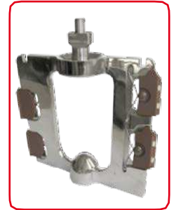
Two blade mixer